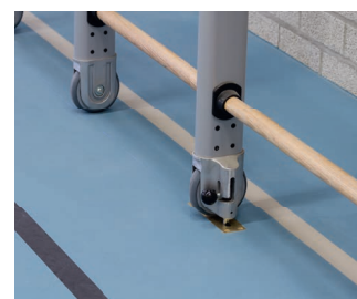
Locking system and floor anchor