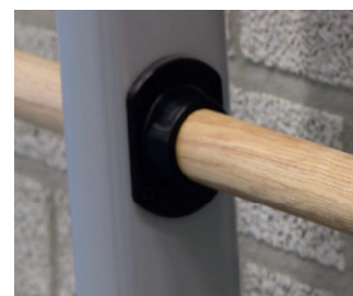
Solid wooden rungs